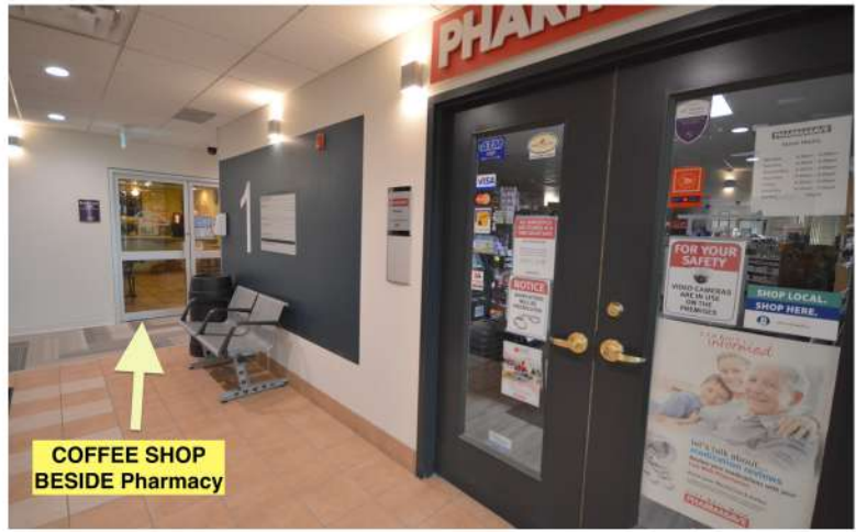
COFFEE SHOP BESIDE Pharmacy